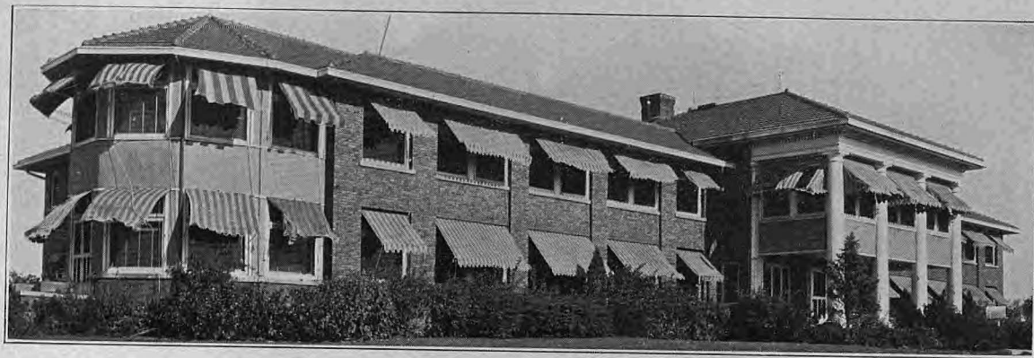
FAIRVIEW SANITORIUM, NORMAL, ILL.