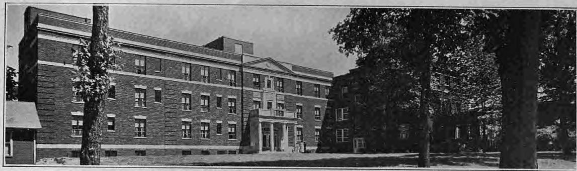
MENNONITE HOSPITAL, BLOOMINGTON, ILL.