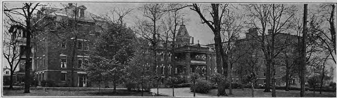
ST. JOSEPH'S HOSPITAL, BLOOMINGTON, ILL.