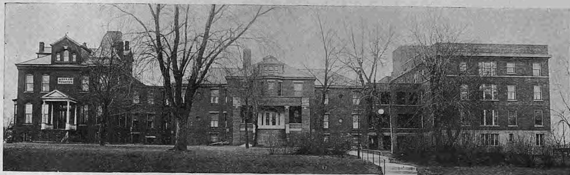
BROKAW HOSPITAL, NORMAL, ILL.